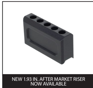
NEW 1.93 IN. AFTER MARKET RISER NOW AVAILABLE